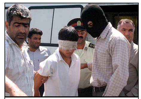
Teenager, accused of having gay sex, led to the gallows. Iran, July 19, 2005.