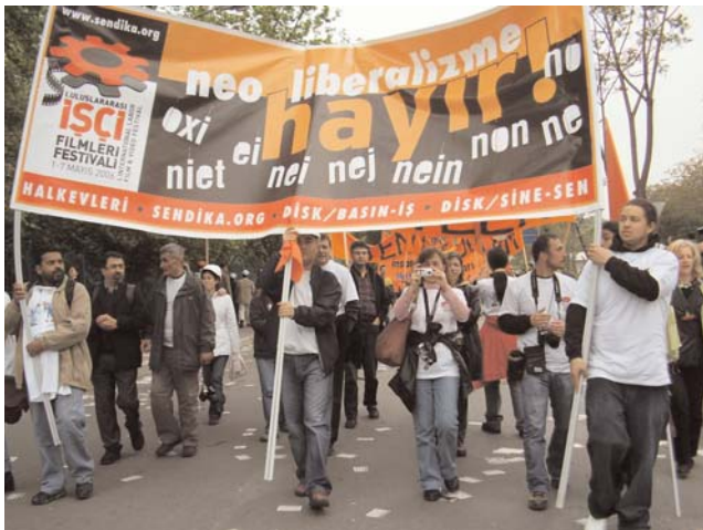
Turkey Labor Fest contingent at May Day march in Istanbul.